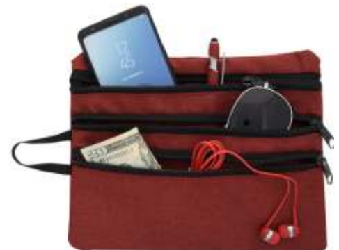
*Contents Not Included