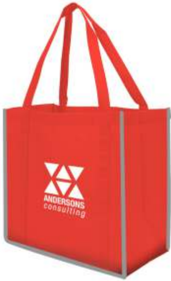
Without Light Reflectivity