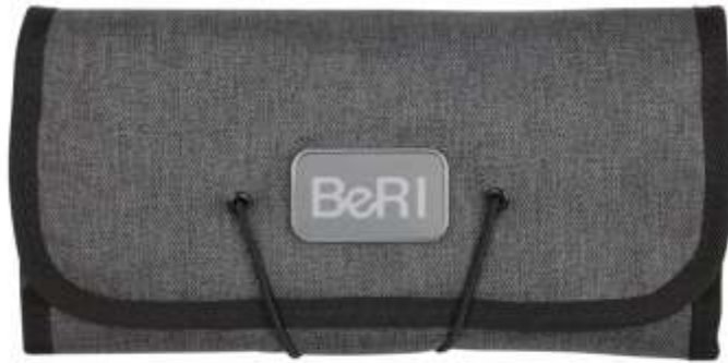
Optional Steel Plate Laser Engraved