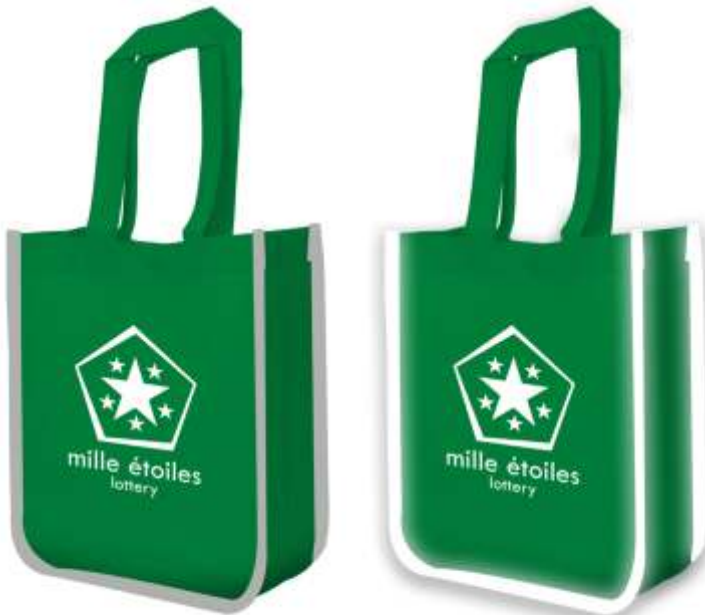
Without Light Reflectivity