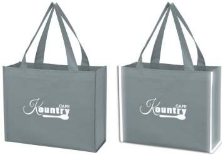
Without Light Reflectivity