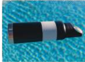
Floats in the water