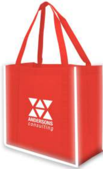
With Light Reflectivity