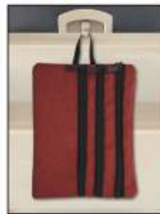
Hang From Loop For Easy Access