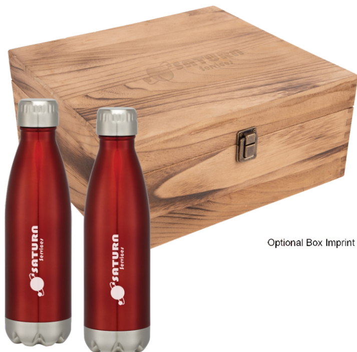
Optional Box Imprint