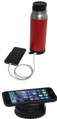
*Phone Not Included